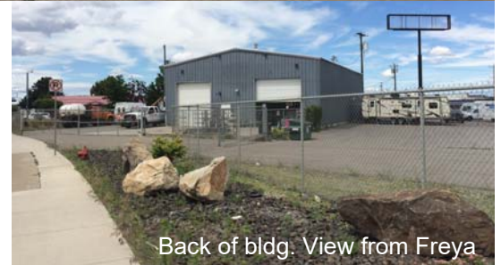
Back of bldg. View from Freya

Site Size: 27,936+/-sf Zoned: Heavy Industrial Parcels: 35152.3209 & 35152.3207 Total Building: 3,942+/-sf Warehouse: 3,558+/-sf Office: 384+/-sf Mezzanine: 384+/-sf Two Restrooms OHD: 2 - 14' h x 12' w 1 - 14' h x 14' w Fenced yard: 15,000+/-sf Power: 3 Phase Pole & Bldg signage Lift in space available for sale by Tenant